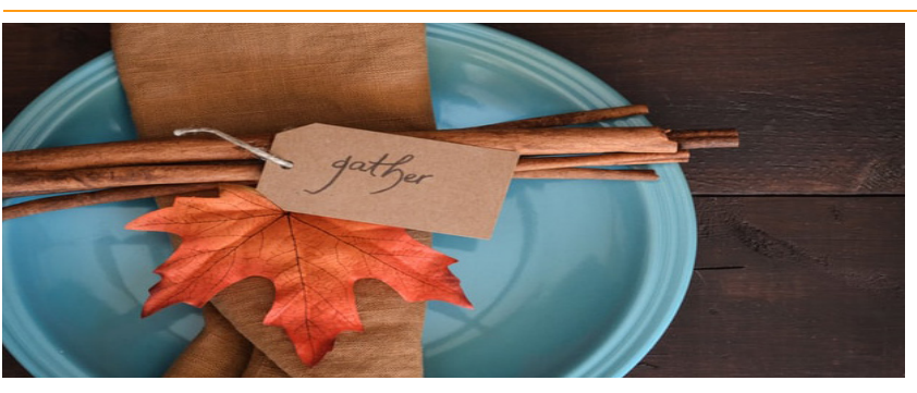
Thanksgiving Turkey Drive

What better way to give thanks than to pay it forward? Join us for our inaugural Thanksgiving food drive, where we will collect nonperishable food for families in need.